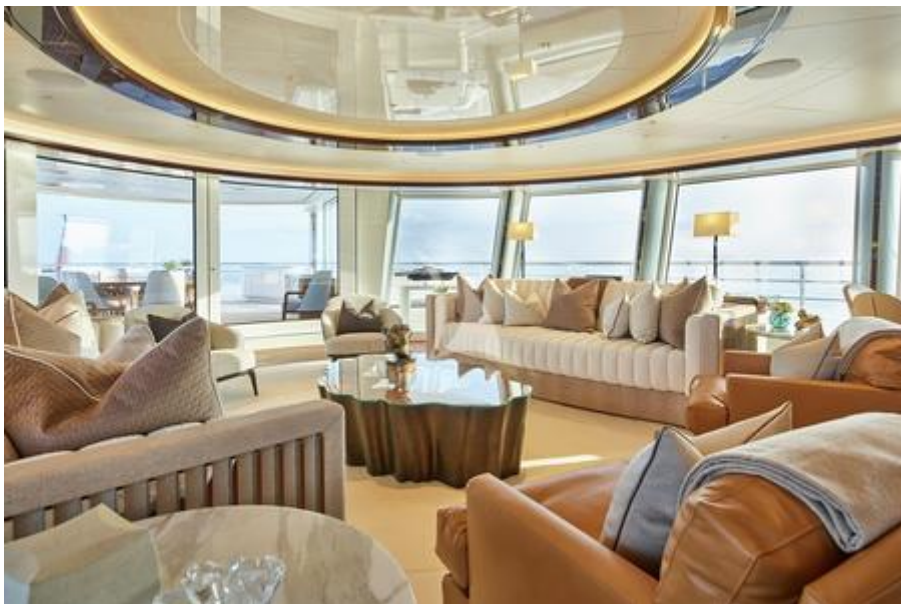
Sky lounge facing aft