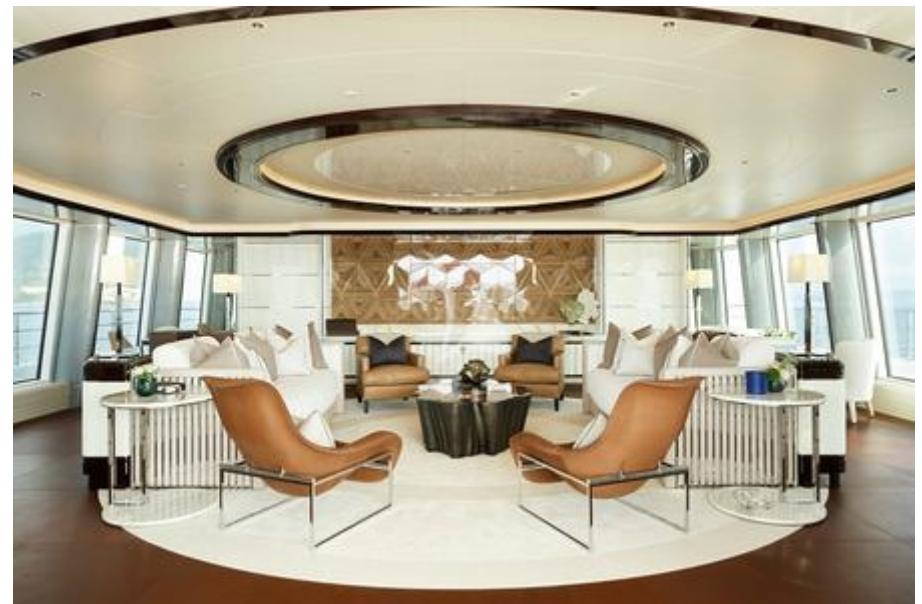
Sky lounge facing forwards