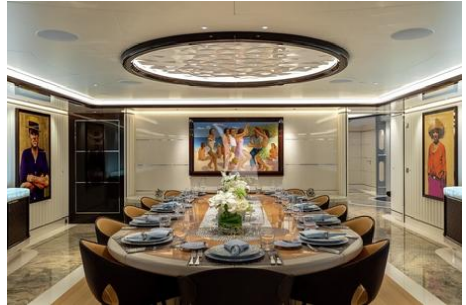
Main deck dining room