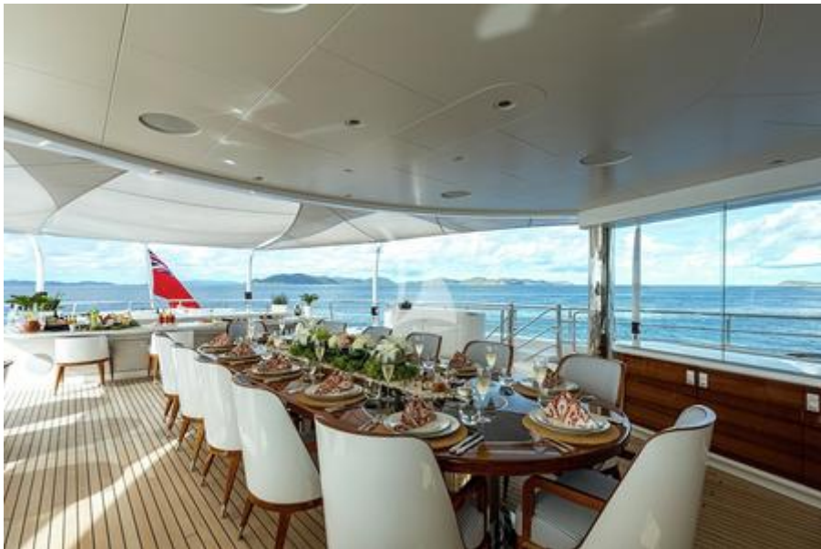
Bridge deck dining area