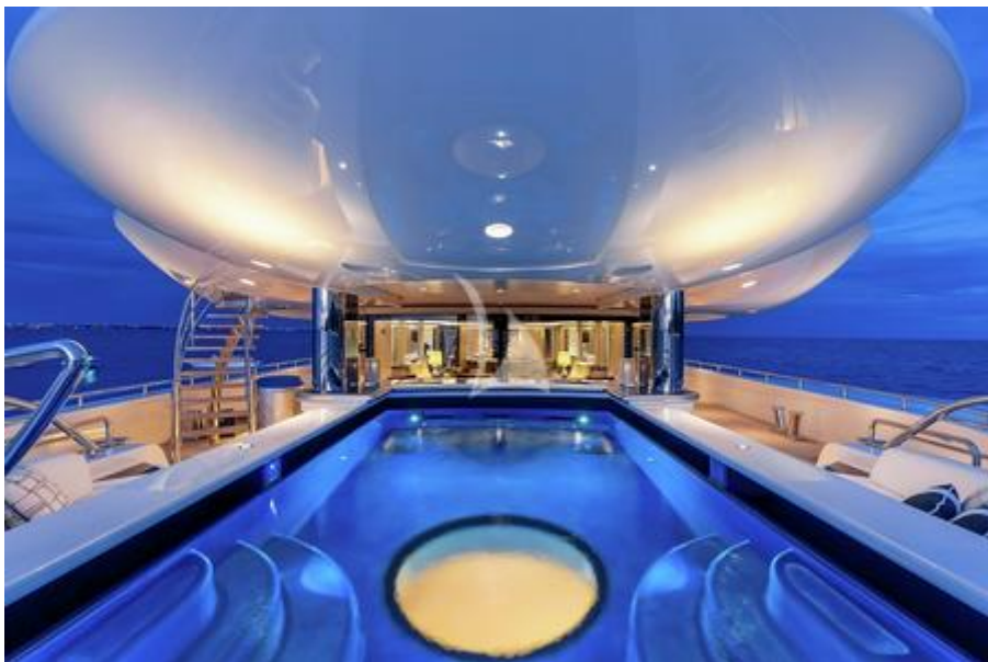
Main deck aft pool