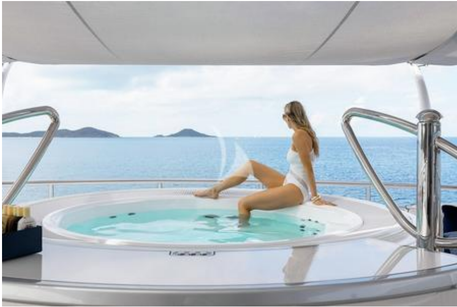
Owner's deck jacuzzi