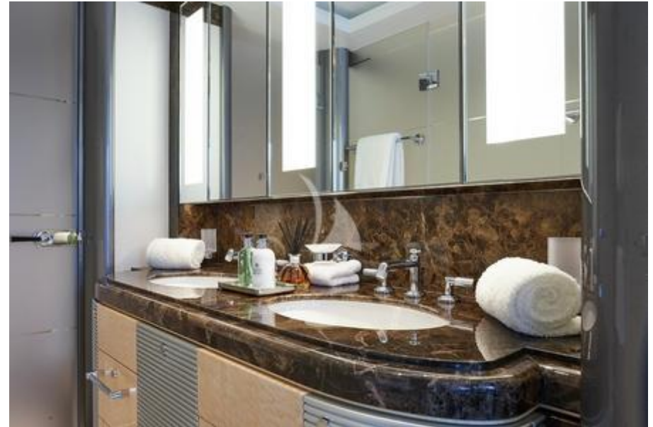
Double shower en suite shower room