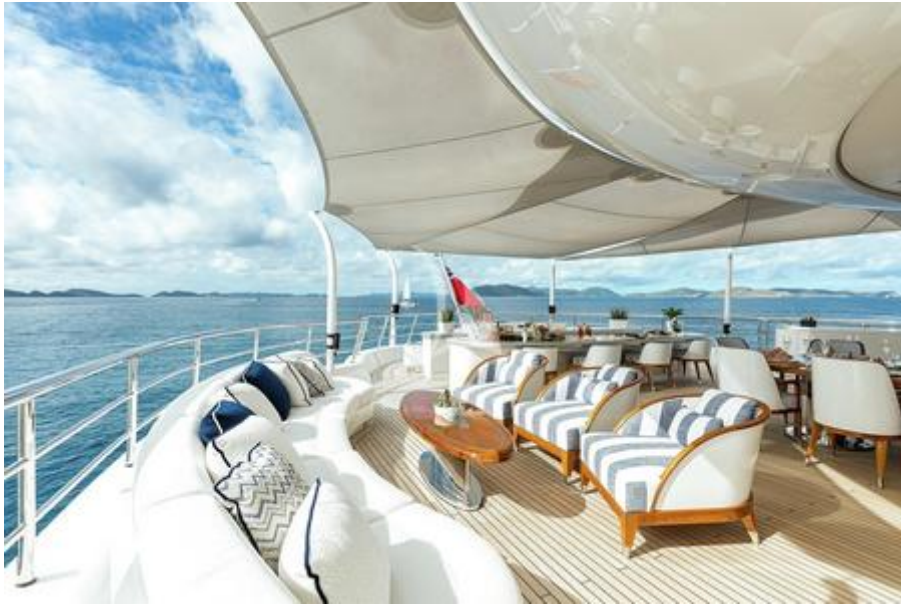
Bridge deck seating area