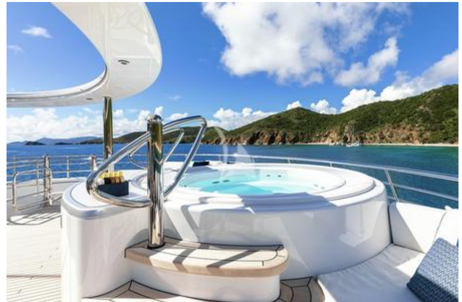
Owner's deck jacuzzi