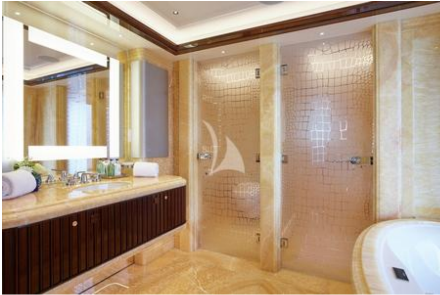
Master shower room en suite