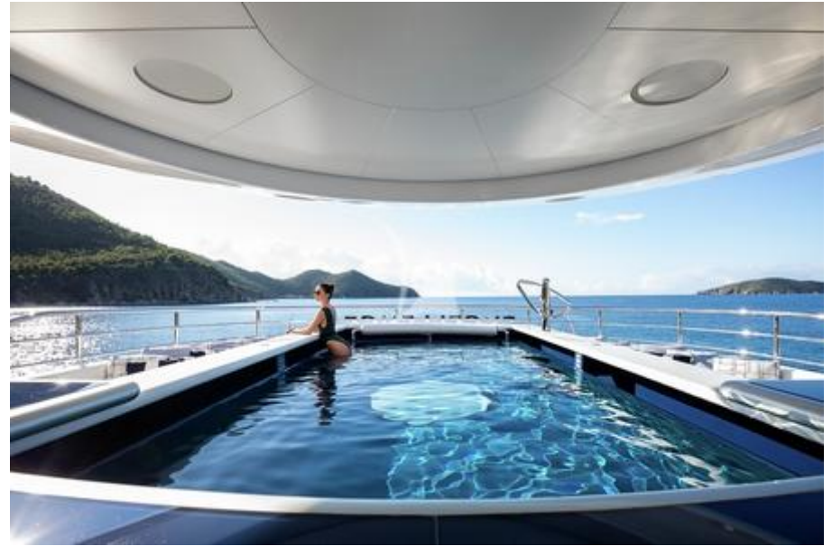
Main deck aft pool