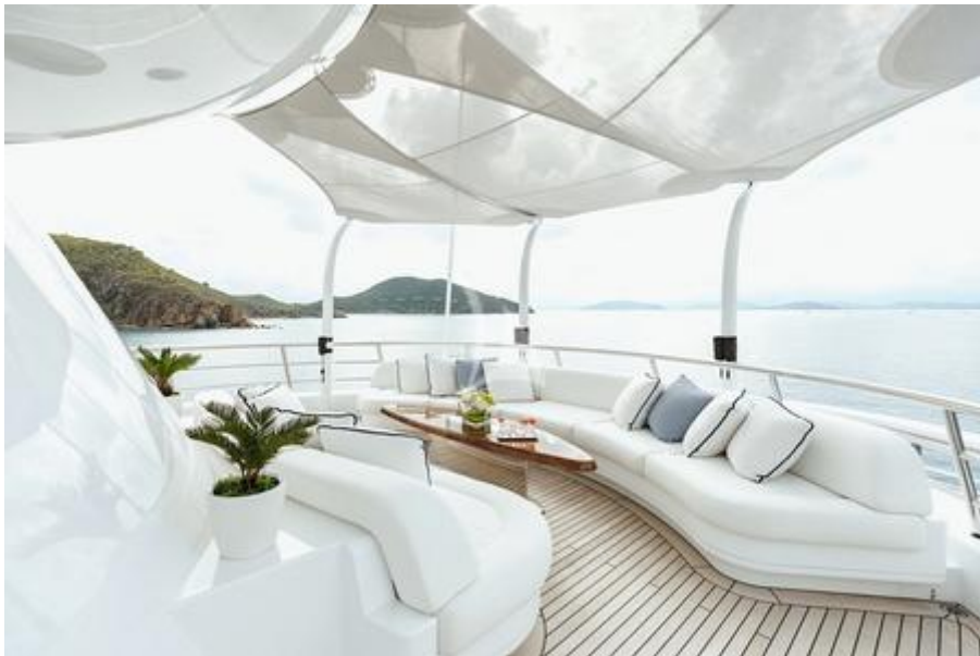
Sun deck seating area