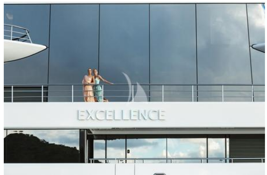
Triple height atrium