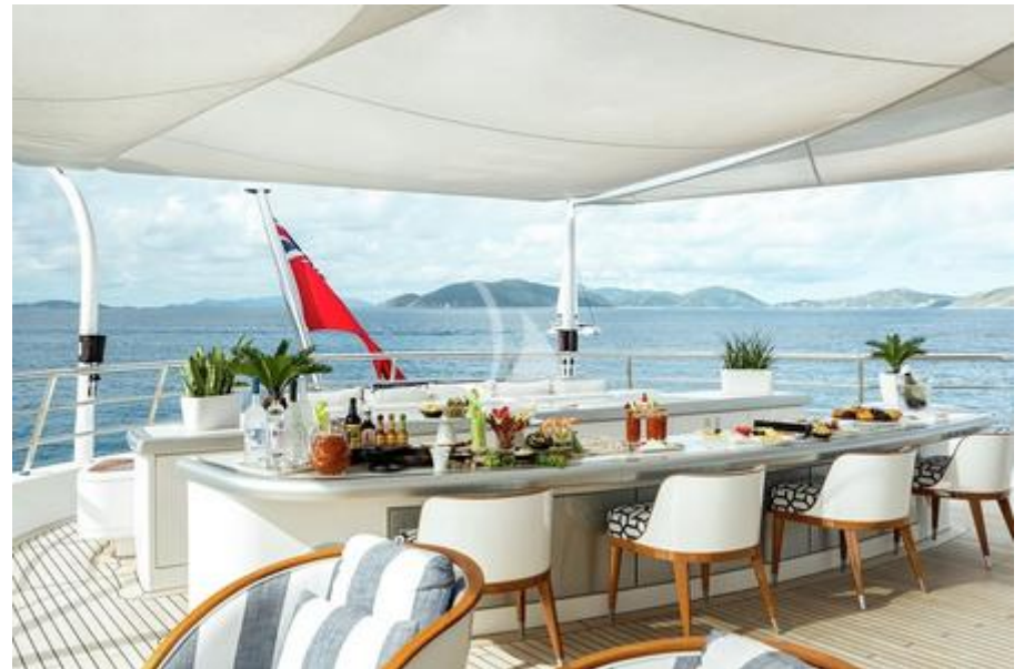
Bridge deck aft