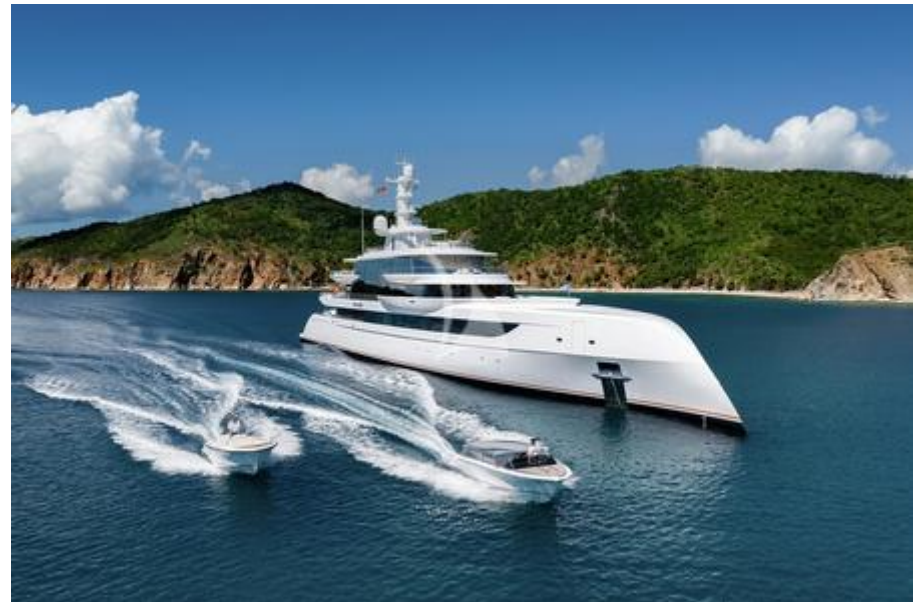
Tenders & toys